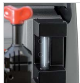
Electronic Optical Reader