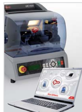
Types of uses: Stand-Alone or with Personal Computer

EXCLUSIVE! with UC199 6 months of FREE Silca Code Program Software!