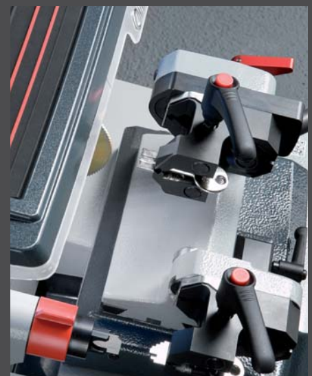
Clamps with different offset.

SILCA S.p.A. Via Podgora, 20 (Z.I.) - 31029 Vittorio Veneto (TV) - Italy Telephone +39 0438 9136 Fax +39 0438 913800