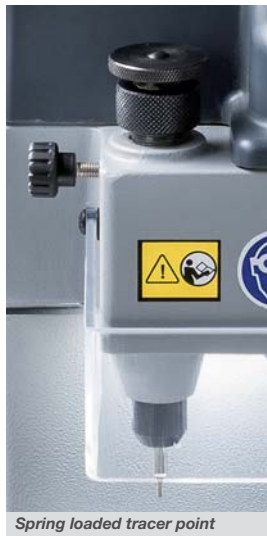
Spring loaded tracer point

The spring loaded tracer point, activated by rotating the locking nut, grants proper centering of cuts on the keys, ensures a perfect depth alignment and allows for adjustment to worn keys.