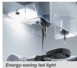
Energy-saving led light

The wide transparent shield protects the operator from moving parts, metal swarf and chips while cutting. The thermal magnetic safety switch turns the machine off automatically in case of power failures, safeguarding the machine itself.