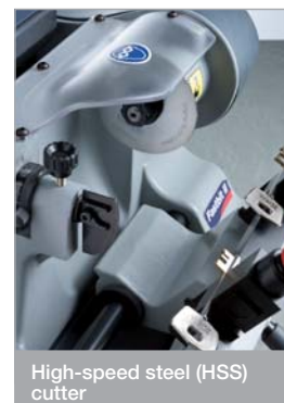
High-speed steel (HSS) cutter