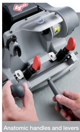
Anatomic handles and levers

Spring loaded tracer point, anatomic handles and levers and tilting clamps for perfect key rounded cuts make the use of Fastbit II comfortable and ergonomic.