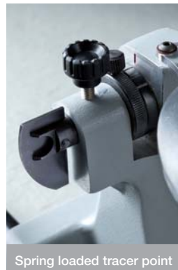
Spring loaded tracer point

Thanks to its micrometric tracer point, the reading of the original key is fast and highly precise. In addition, the operator can adjust with ease depth variations, often needed with worn keys.