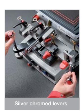
*also long-stemmed keys for safes

Brand new, long-lasting cutter with cutting-edge material coating and innovative design, that guarantees stability while cutting, vertical cuts carriage, pull-out gauge, led lighting, radial motion clamps and much more.